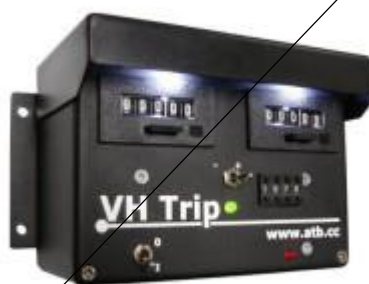
Tripmaster not purely mechanical