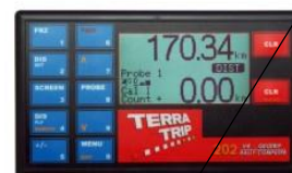
Tripmaster not purely mechanical