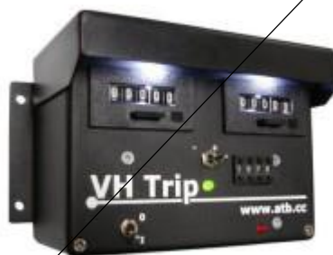
Tripmaster not purely mechanical