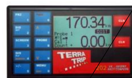
Tripmaster not purely mechanical