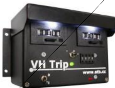
Tripmaster not purely mechanical